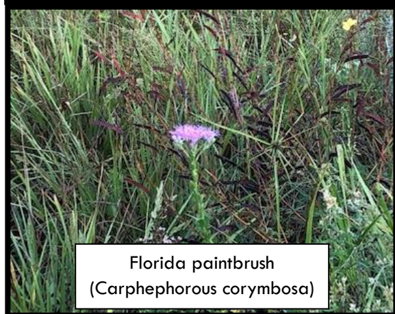
Florida paintbrush ( Carphephorus corymbosa )