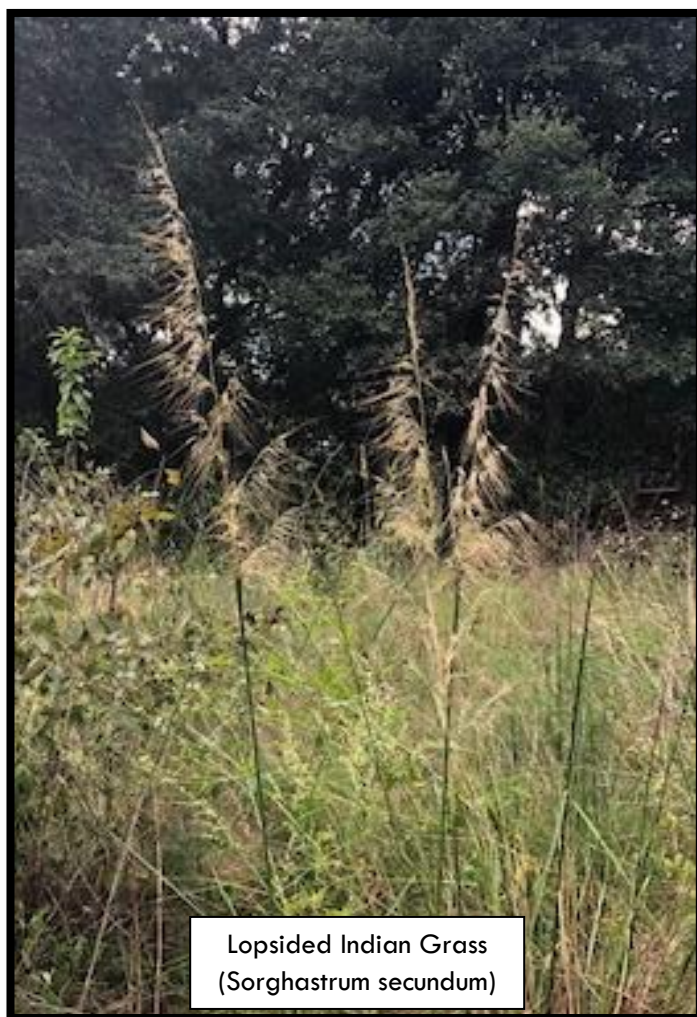
Lopsided Indian Grass ( Sorghastrum secundum )