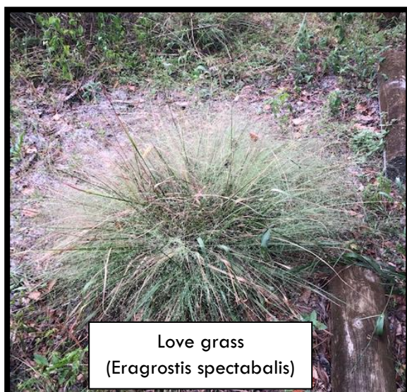
Love grass ( Eragrostis spectabilis )

It's autumn, although from the weather it would be hard to tell. One look at the Florida natural areas though will give it away. Regardless of the heat, lack of rain, and crazy weather, our native plants are showing off. From the tall, graceful Lopsided Indian Grass ( Sorghastrum secundum ) swaying in the wind, to the low mounds of love grass ( Eragrostis spectabilis ) with their sprays of feathery purple wands lighting up like neons in the landscape, fall in the Florida sandhills is a walk in a wonderland. Well maybe that's going a little far. The amazing array of fall flowers amongst the grasses is always a surprise. Blazing star ( Liatris spicata ), Florida paintbrush ( Carphephorus corymbosa ), Goldenrod ( Solidago stricta ), Goldenaster ( Chrysopsis scabrella ), Palafox ( Palafoxia feayi ), Pineland lantana ( Lantana depressa ), and many others are all to found peeking up from the grasses. Even the Flower Scrub Mint ( Conradina canescens ), a winter bloomer is starting to show their purple blooms. The Firebush ( Hamelia patens ) flowers are turning to fruit (drupes) in time for the winter migrating birds to stop by. We are starting to see many fall migratory birds, like the warblers, kinglets, buntings, and catbirds. The trees are alive with their songs as they scavenge. So, get out and enjoy the fall landscape on the upland trails at Oakland Nature Preserve and see if you can identify the flowers, grasses, and birds.