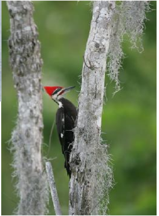
Our largest woodpecker, the Pileated Woodpecker , can be heard hammering and calling throughout the preserve. Keep an eye out for the young sticking their heads out of a cavity when the parent shows up with food. Some times they will nest in places that can be seen from the boardwalk.

Bald Eagles are nesting in the preserve though the nest can't be seen from the boardwalk. They are seen on occasion gathering nesting materials, perched on a snag, catching a fish or taking it from an Osprey.